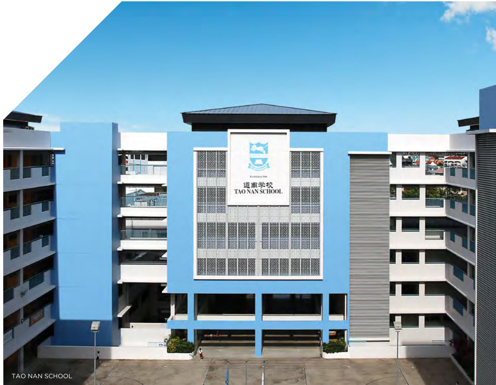
TAO NAN SCHOOL