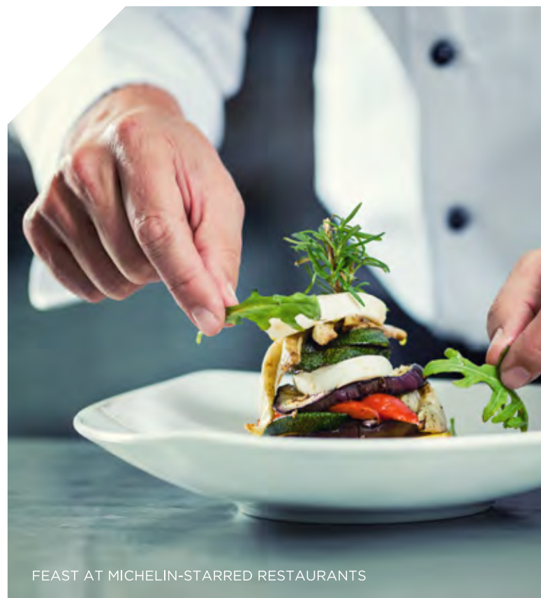
FEAST AT MICHELIN-STARRED RESTAURANTS