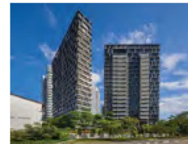
FRASER RESIDENCE ORCHARD SINGAPORE