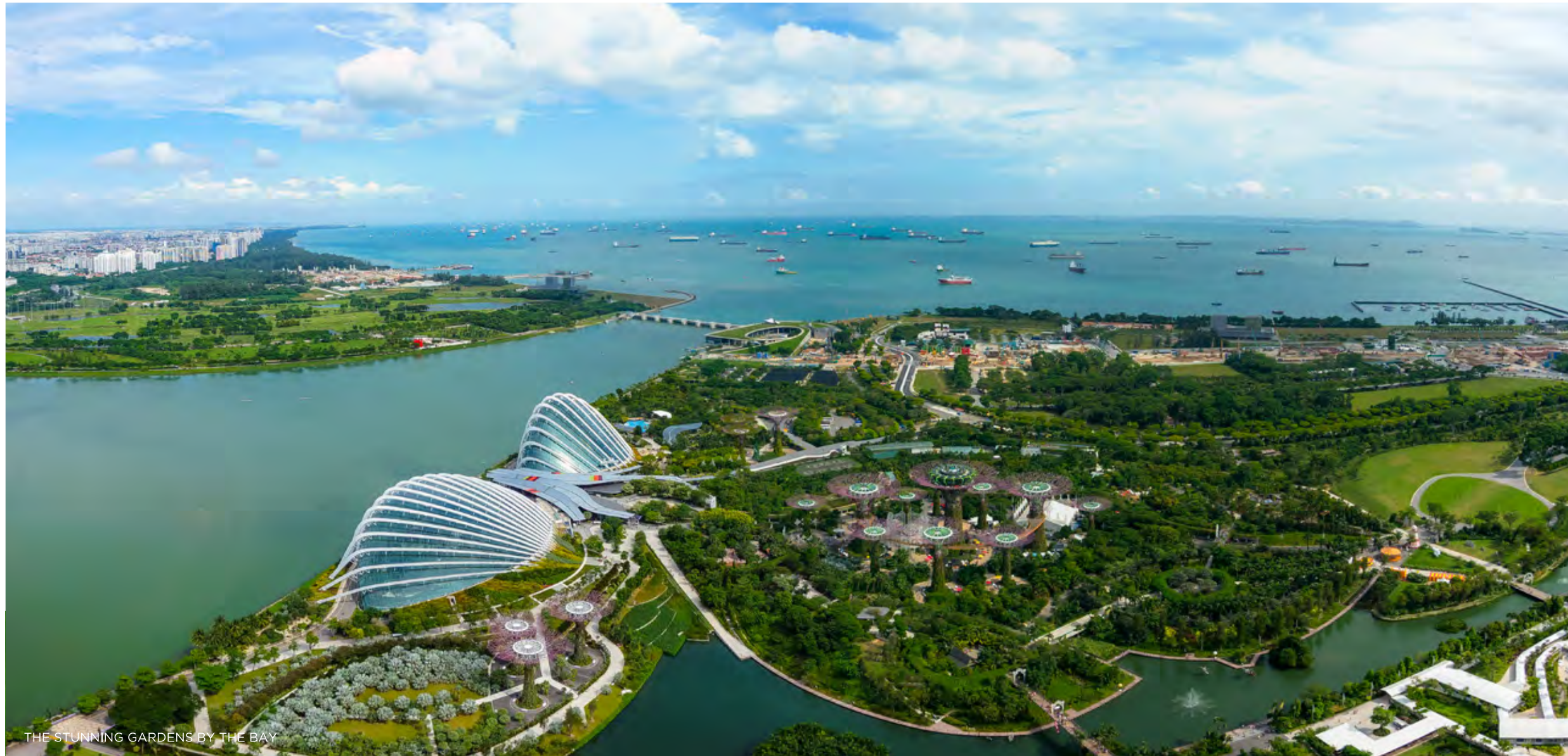
THE STUNNING GARDENS BY THE BAY