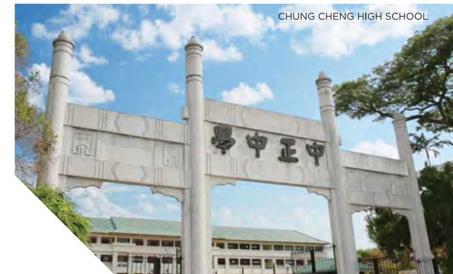
CHUNG CHENG HIGH SCHOOL