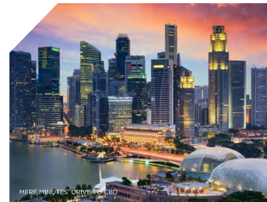
MERE MINUTES' DRIVE TO CBD

LIV@MB is only 3 minutes' walk to the future Katong Park MRT station, and a short drive to the CBD, home to many regional offices of multinational corporations in the banking, financial and technology sectors. That makes commuting to and from work quicker so that you can concentrate on what is more important to you.