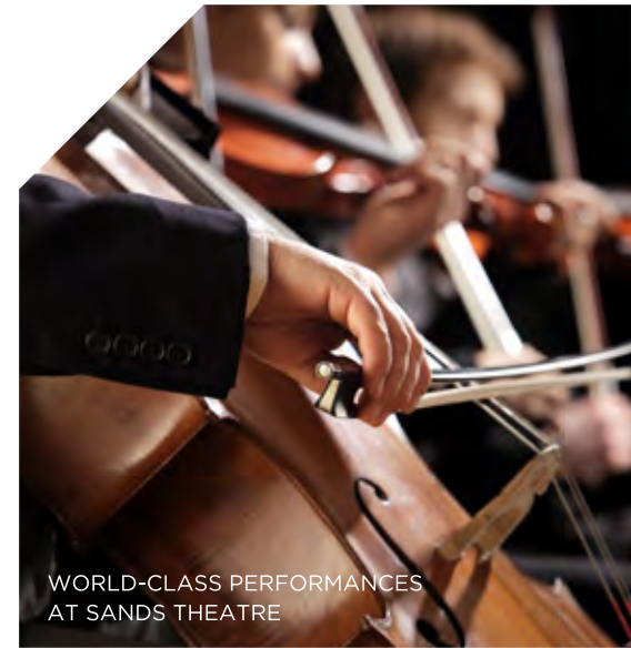
WORLD-CLASS PERFORMANCES AT SANDS THEATRE

Marina Bay Sands, a short drive from LIV@MB, offers non-stop entertainment from dusk to dawn. Awaken to the beauty of its world-renowned rooftop infinity pool. A shopping experience like no other awaits at the exquisite boutiques. Dine on award-winning cuisine from around the world. Be entertained at the ArtScience Museum, catch a world-class performance, then party the night away.