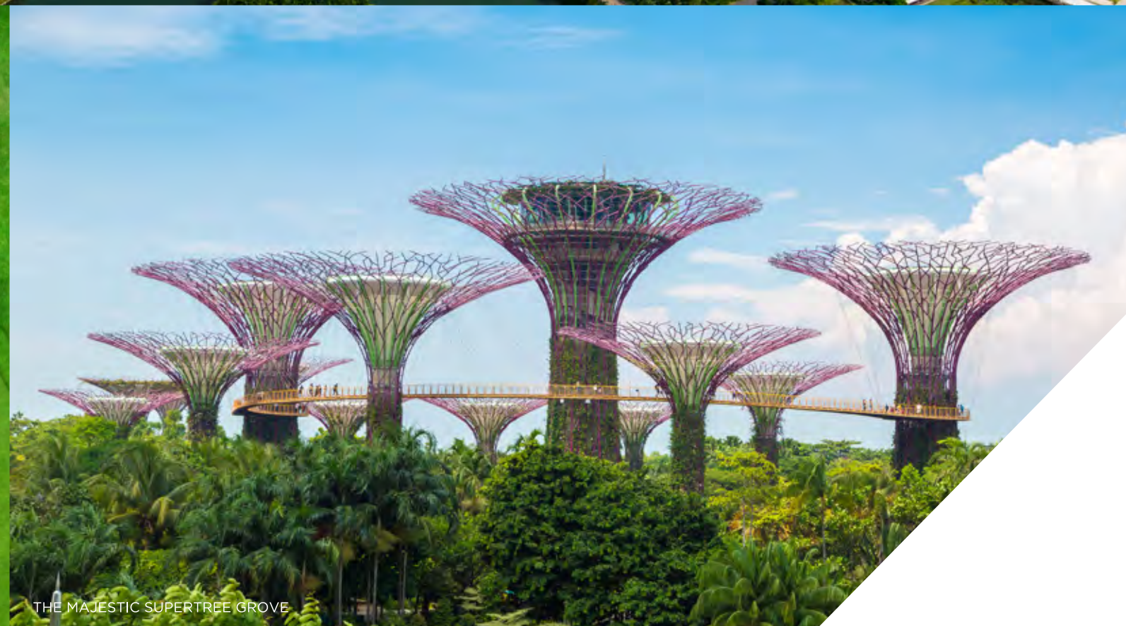
THE MAJESTIC SUPERTREE GROVE