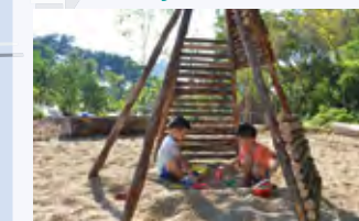
Nature play gardens