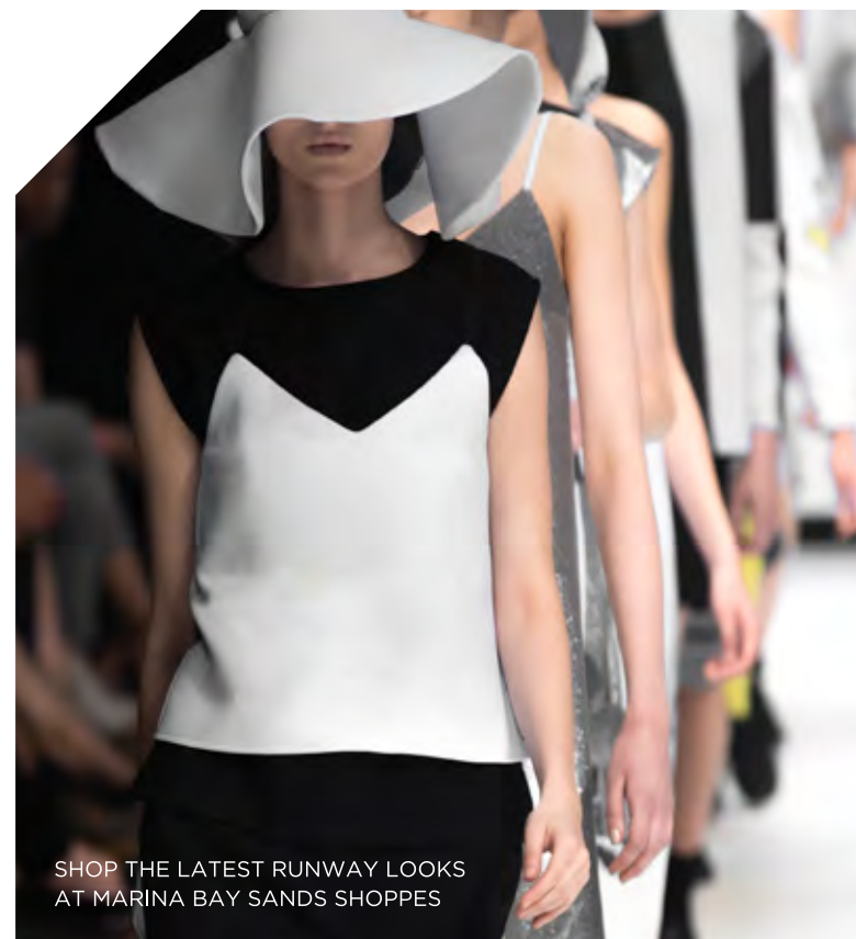
SHOP THE LATEST RUNWAY LOOKS AT MARINA BAY SANDS SHOPPES