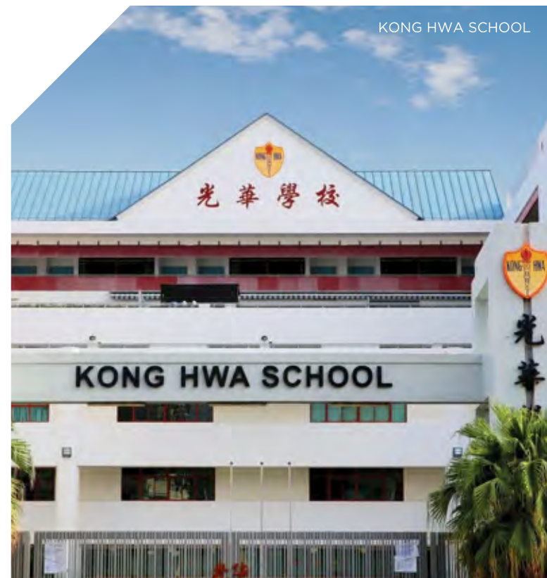
KONG HWA SCHOOL

Quality education at every stage of your child's life is always within easy reach. LIV@MB is strongly supported by a vast selection of educational institutions, including some of Singapore's most popular schools, near home.