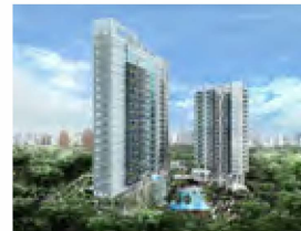
THE VERMONT ON CAIRNHILL