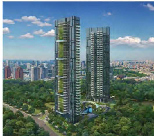
8 ST THOMAS