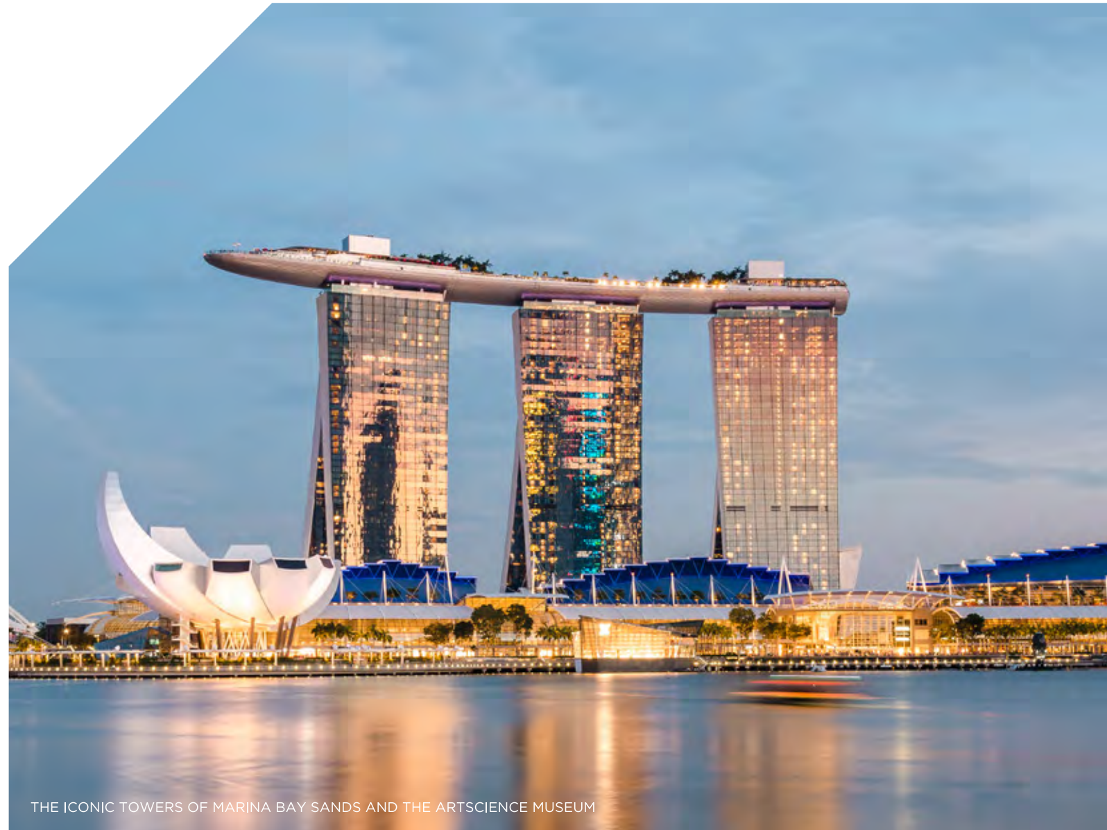
THE ICONIC TOWERS OF MARINA BAY SANDS AND THE ARTSCIENCE MUSEUM