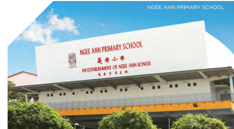
NGEE ANN PRIMARY SCHOOL