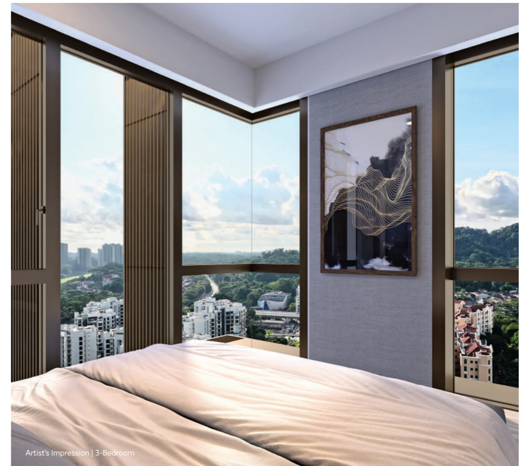
Artist's Impression | 3-Bedroom

Picture waking up to the soft hues of sunrise from your master bedroom through captivating L-shaped windows, or unwinding in the evening with views of breathtaking sunsets right from your balcony.