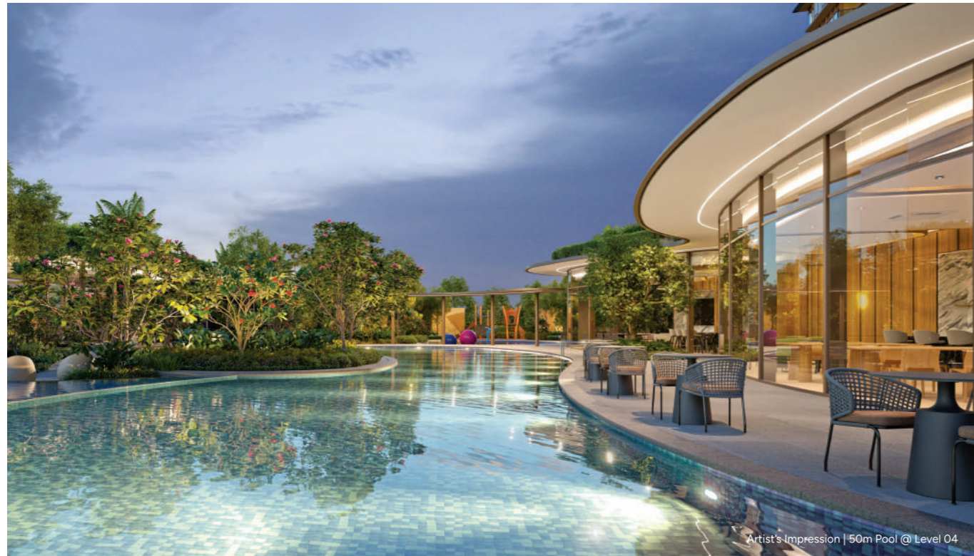
Artist's Impression | 50m Pool @ Level 04

At Hillhaven, you will enjoy opportunities for enrichment. Whether you're seeking dynamic outdoor adventures like biking or prefer the tranquillity of community gardening, Hillhaven gives you room for constant growth and learning.