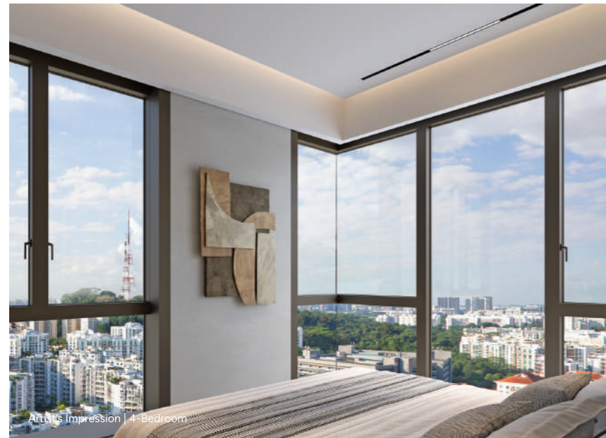
Artist's Impression | 4-Bedroom