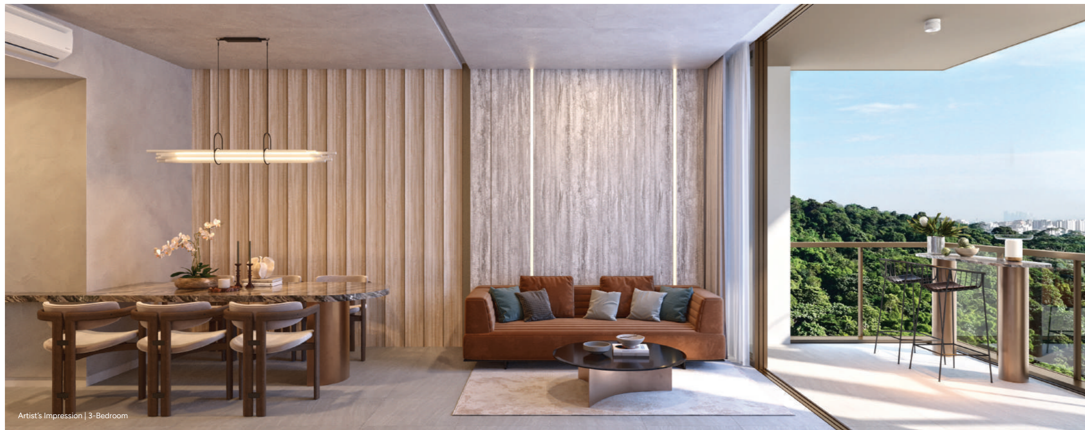
Artist's Impression | 3-Bedroom

Each layout has been meticulously designed to create the most efficient home, ensuring you get the very best use of space. Transform the attached study room into your own dedicated hobby area or a convenient home office, allowing you to pursue your interests and work comfortably from home.