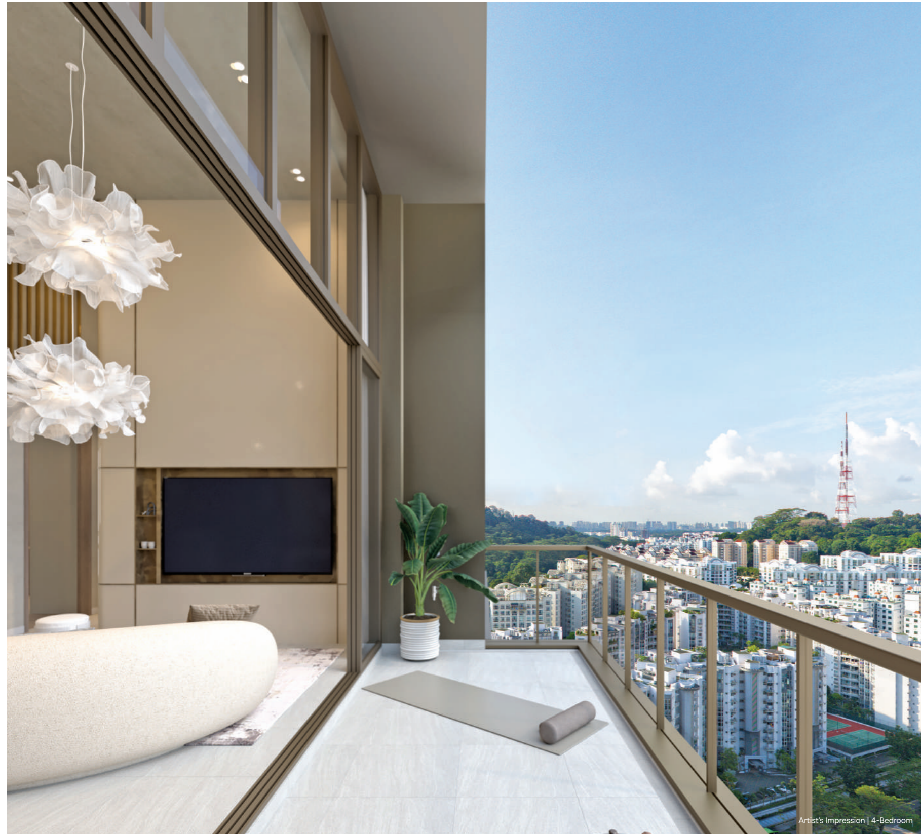
Artist's Impression | 4-Bedroom