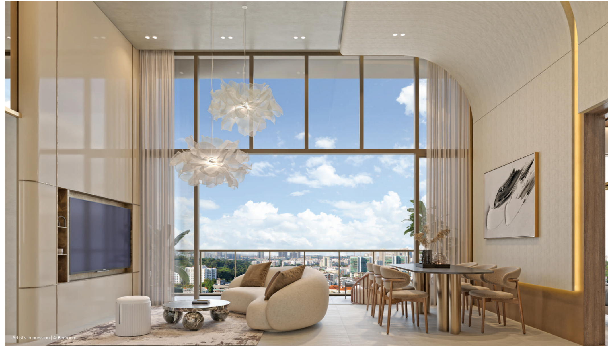
Artist's Impression | 4-Bedroom