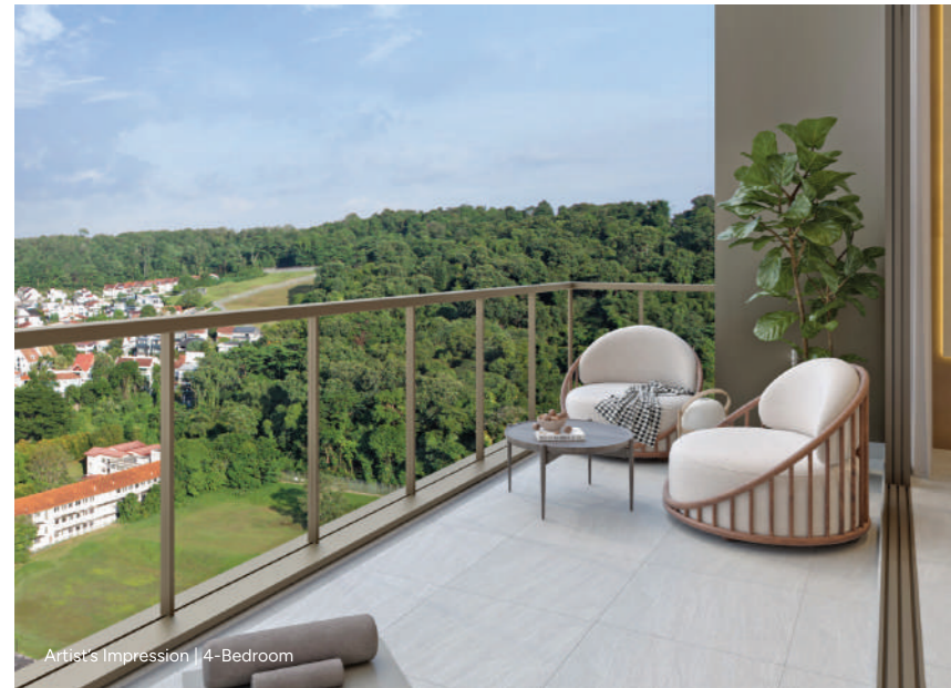
Artist's Impression | 4-Bedroom