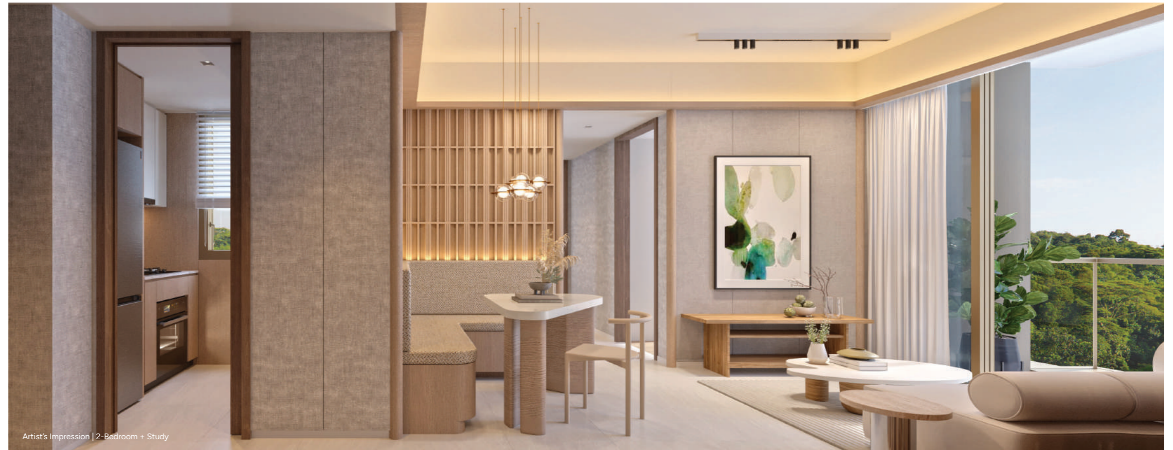
Artist's Impression | 2-Bedroom + Study

Every 2-bedroom + study unit comes with an enclosed kitchen with natural ventilation and a smart gas hob connected to the iAppliances app. Enjoy extended living space seamlessly connecting to your balcony, offering indoor comfort and outdoor relaxation.