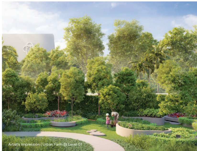
Artist's Impression | Urban Farm @ Level 01

Step out of the urban hustle and come home to a relaxing swim in the 50m pool or spray down your bicycle at the bikers' corner after a satisfying adventure through the 20km Western Adventure Cycling Loop. Find a space that nurtures the mind, body, and soul.