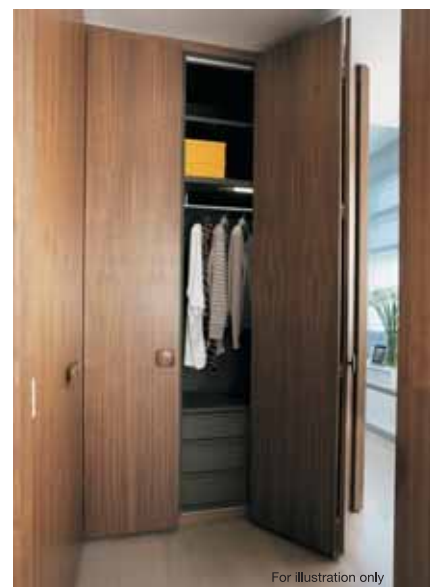
Walk-in Wardrobe* – With luxuriant space for your designer collection, it is like stepping into your private fashion gallery.