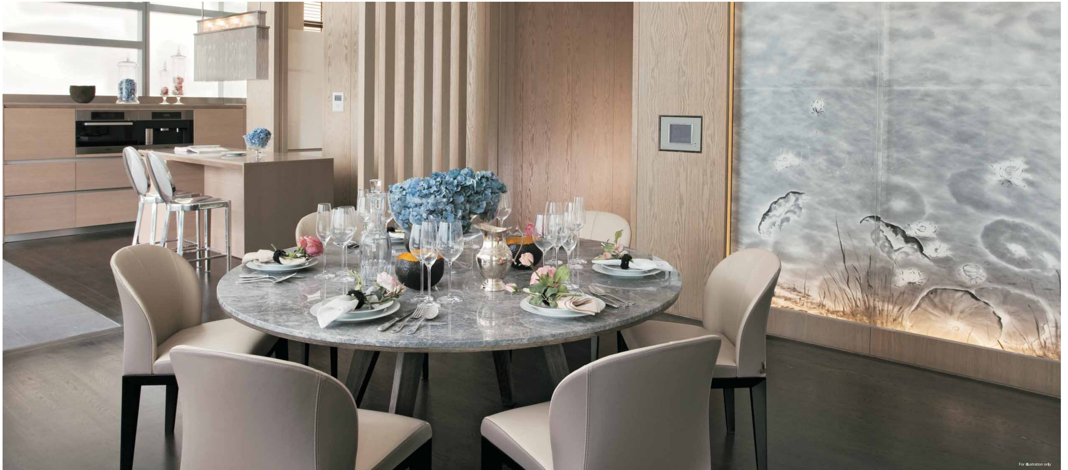
Dining Room – A vast space to entertain, wine and dine in style