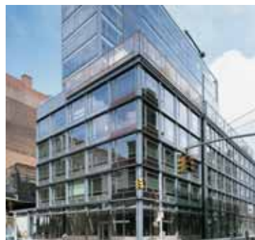
40 MERCER ST RESIDENCES - New York, USA