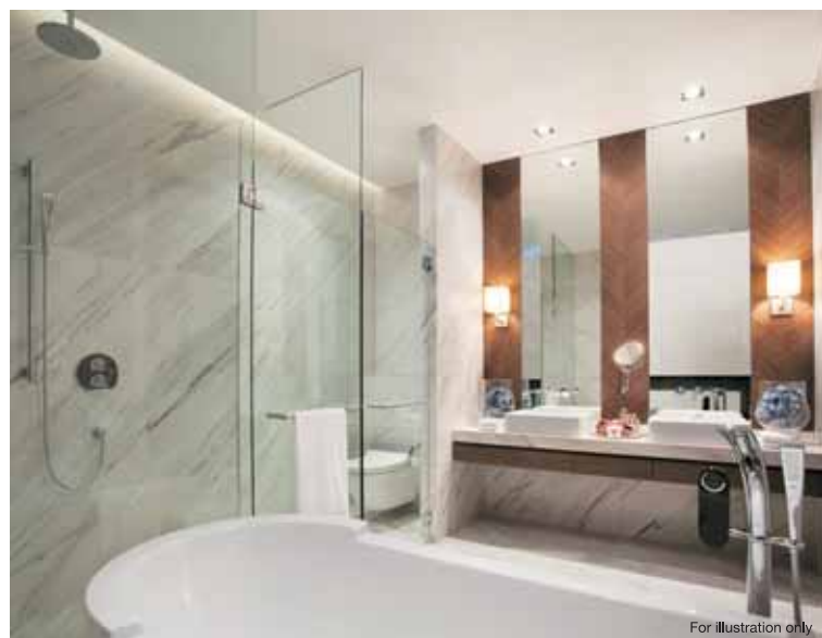
Master Bathroom – Soak in the attention to detail, right down to the superior fittings from Grohe and Duravit