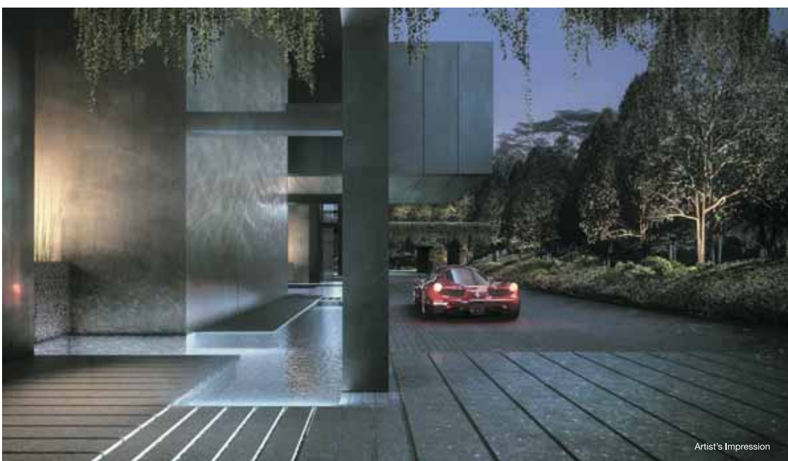
The Arrival Lobby – Be welcomed by a vista of sophisticated elegance and understated grandeur as you arrive home to accustomed luxury