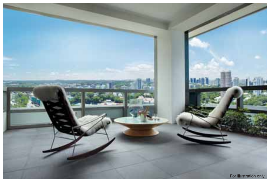
Private Balcony – The perfect place to revel in the evening tranquillity with the sparkling city skyline as your backdrop