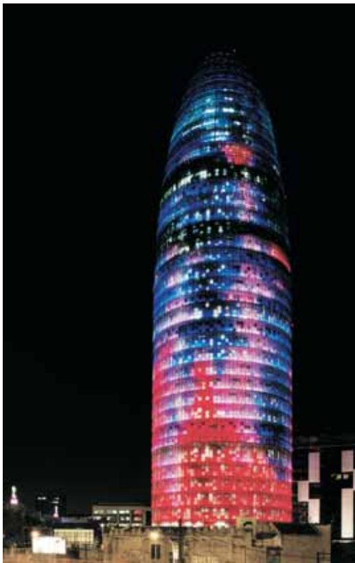
TORRE AGBAR - Barcelona, Spain