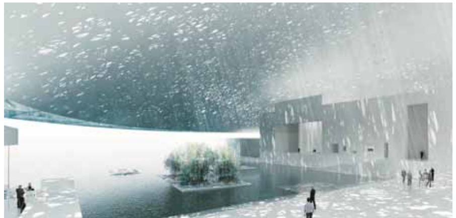
LE LOUVRE - Abu Dhabi