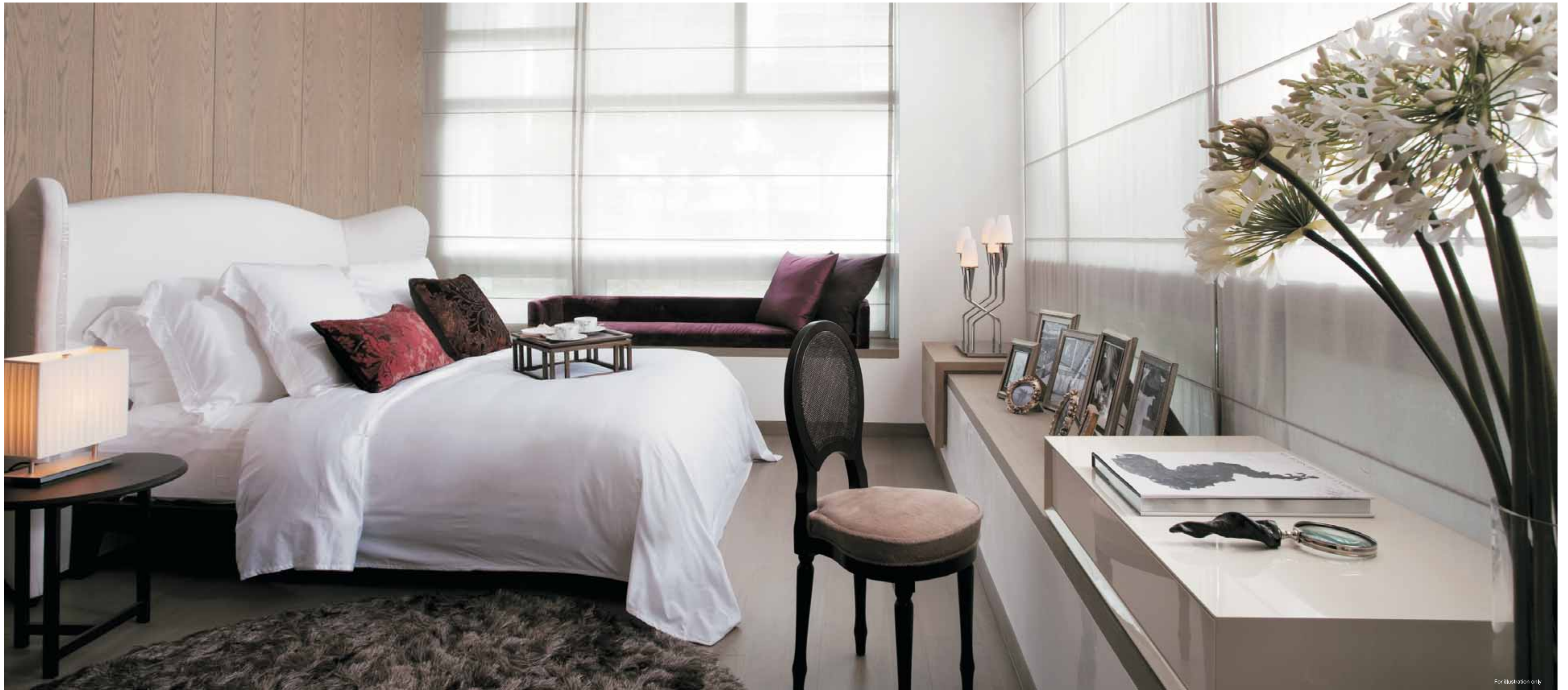
Master Bedroom— Enjoy total privacy and exclusivity in this large personal living space