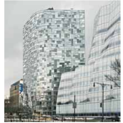
100 11 TH AVENUE - New York, USA