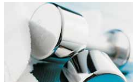
All images are for illustration only