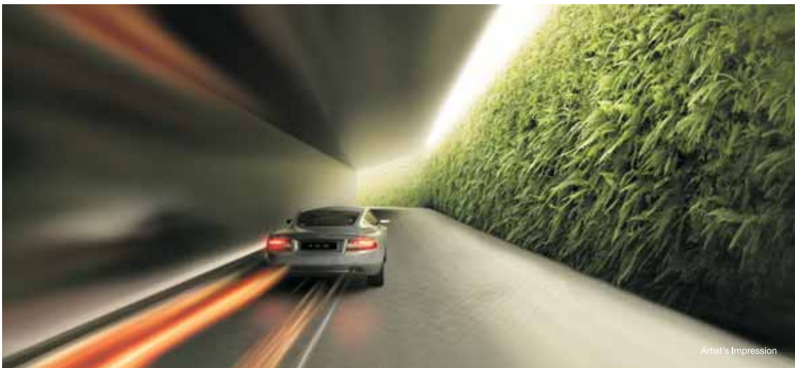
The Gateway Boulevard – The buzz of city life dissipates the moment you drive through the dramatic driveway lit by a linear strip of natural lighting

In the prime and lush Ardmore and Anderson enclaves, the main tower showcases a network of vertical greenery amidst a striking facade. The masterful arrangement of complementary tones of glass, creates an ever-changing palette from every different angle. The elegant beauty of the singular square tower is also further enhanced by having all four frontages distinctively unique, making Nouvel 18 a true architecture masterpiece.