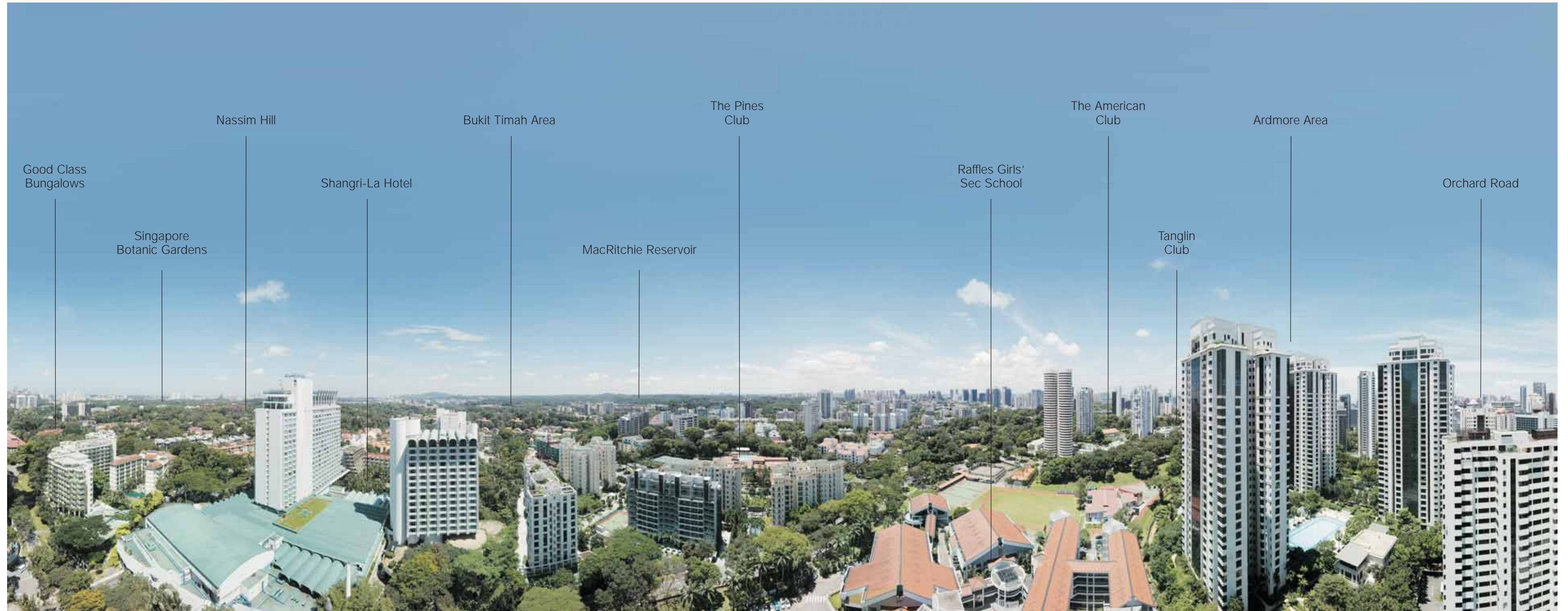
View from development site

Nouvel 18 is designed with considerations of the geography, history, colours, vegetation and landscapes. In the words of the master architect himself, "buildings are not done only to be the most beautiful, but also to give advantage to the surroundings. Each architecture is the missing piece of the puzzle, to create poetry with the place".