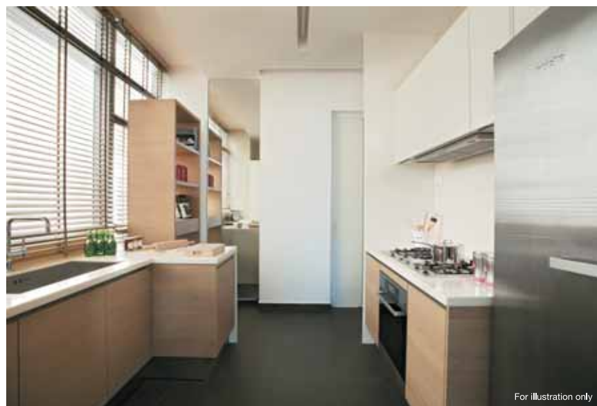
Kitchen – Fully equipped to impress with inspiring culinary creations