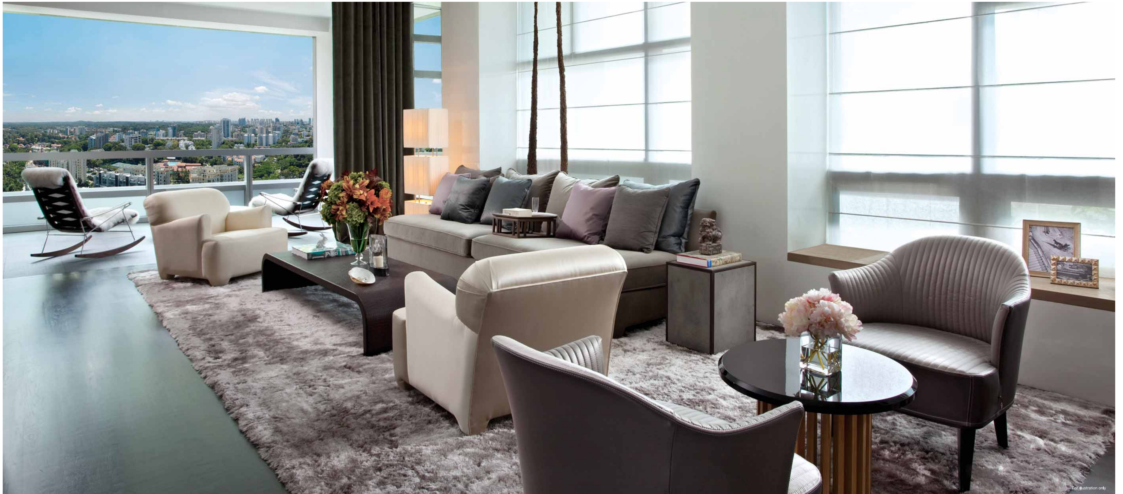
Living Room – Lavishly spacious and defined by meticulous design