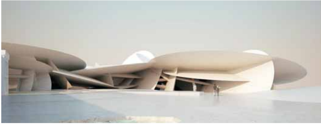
NATIONAL MUSEUM OF QATAR - Doha, Qatar