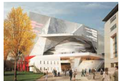
LA PHILHARMONIE - Paris, France