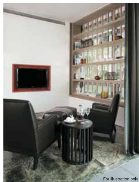
Family/Study Room – Enjoy the freedom to transform this into a conducive area for a study, a library or even an entertainment room with your very own theater