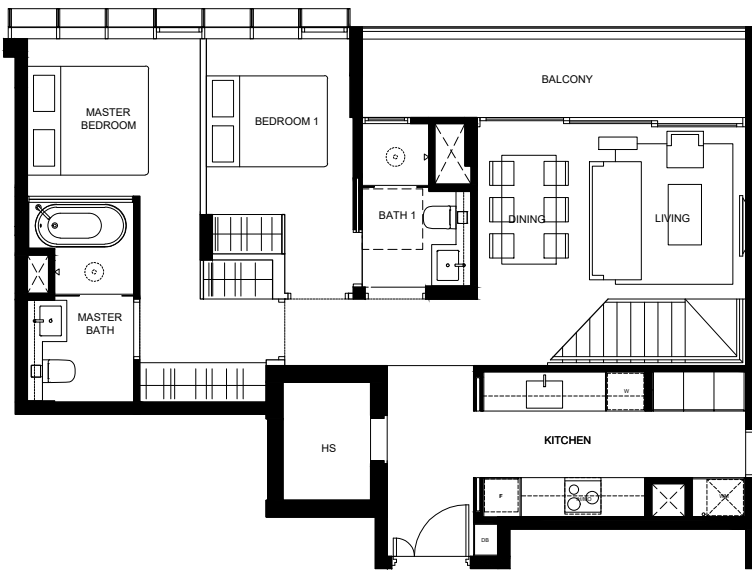
5th Storey Level

38 Shrewsbury Road # 05-02 Singapore 307818