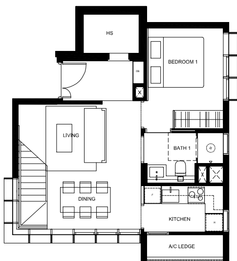
5th Storey Level

38 Shrewsbury Road # 05-04 Singapore 307818